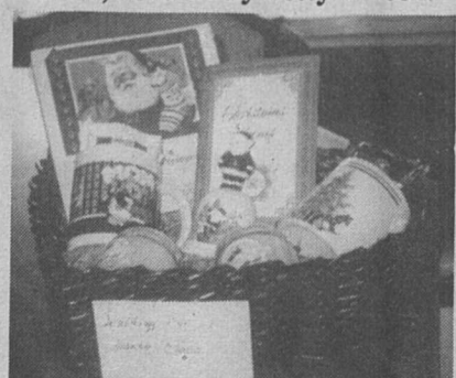
Betty also wants you to be Waiting for Santa Claus with this gift basket containing Christmas cards, a book of poetry, coffee, cocoa and candles.