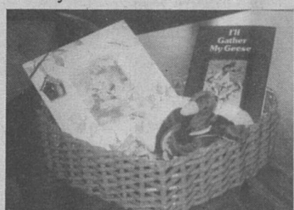
Birds of a Feather Flock Together is a gift basket for quiet moments by the fire, donated by Betty Wilcox.

Plan to spend Oct. 27 supporting your Firemen and Library.